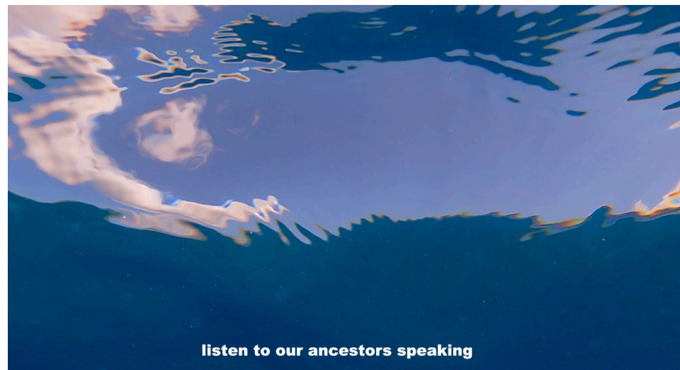
listen to our ancestors speaking